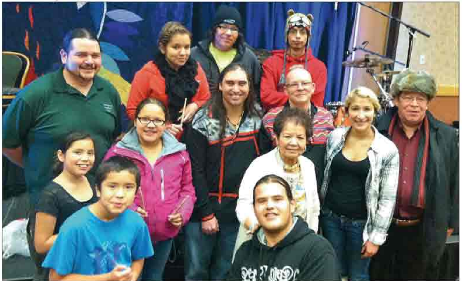
Carry The Cure, hosted in early December, offered healing and wellness strategies to our community. Read more about the event on page 10.