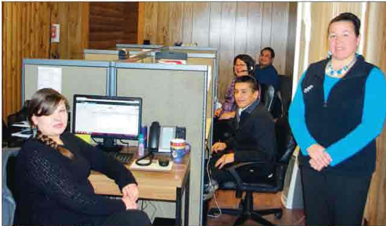
BDC Internet Lending Call Center