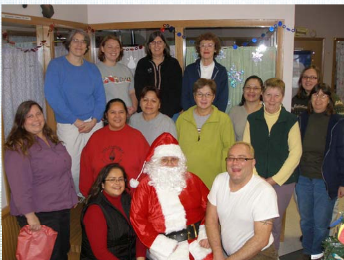
Head Start Staff Get a Visit from Santa