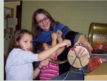
Pulling Raffle Winners