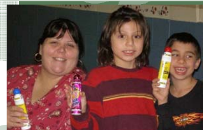
Benefit Bingo Supporters